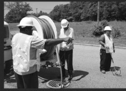
AFFIRMATIVE ACTION/EQUAL OPPORTUNITY